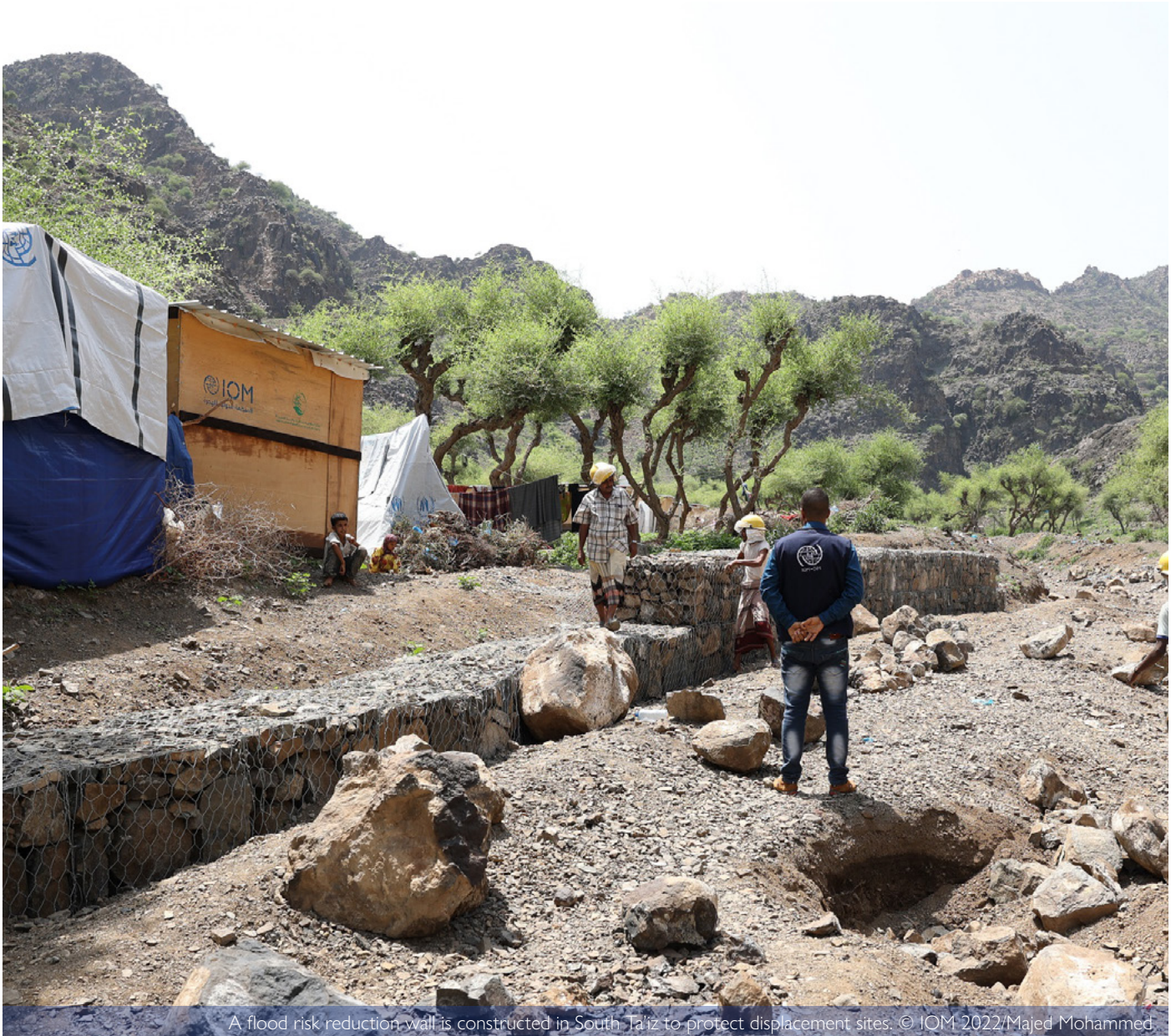
A flood risk reduction wall is constructed in South Ta'iz to protect displacement sites.

The CCCM teams also conduct community mobilization and relative capacity building on awareness raising on COVID-19 preparedness and response, encouraging community participation, and creating opportunities for often excluded groups, such as women, persons with disabilities and youth, to take part in camp leadership and other empowerment initiatives.