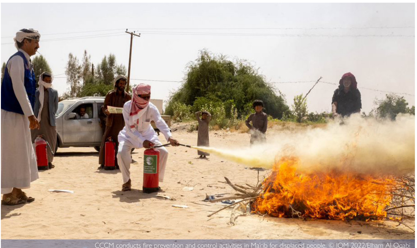
CCCM conducts fire prevention and control activities in Ma'rib for displaced people.