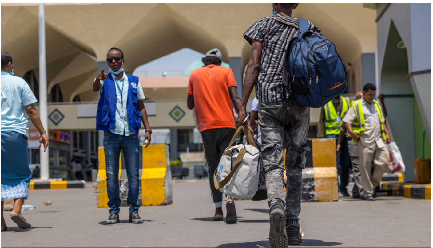
Stranded migrants prepare to embark on IOM's Voluntary Humanitarian Return flight to Ethiopia from Aden.

IOM adopts a comprehensive approach, mainstreaming protection across all multisectoral programming, and training staff on safe identification and referral of protection cases. IOM conducts regular protection mainstreaming audits of key service areas that include health centers, water points, food distribution sites, protection centers, and other registration points to identify if there are any structural barriers to meaningful access to services. Furthermore, when it comes to food and non-food distributions, IOM fast tracks Persons with Specific Needs to ensure the overall safety and dignity is preserved. To complement this, the IOM Protection team further engages with various vulnerable groups as part of participation and accountability to affected populations.