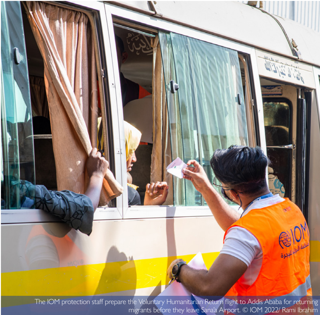
The IOM protection staff prepare the Voluntary Humanitarian Return flight to Addis Ababa for returning migrants before they leave Sana'a Airport.