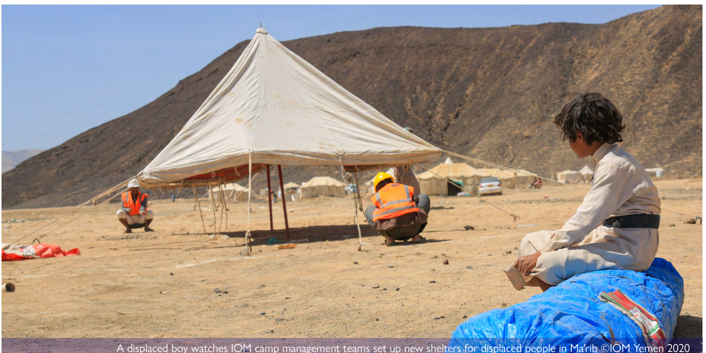
A displaced boy watches IOM camp management teams set up new shelters for displaced people in Ma'rib.