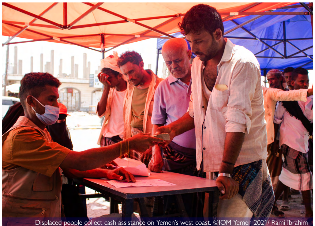
Displaced people collect cash assistance on Yemen's west coast.

IOM's cash transfer mechanism will be delivered either via static points where existing branches of its financial service provider are based or via the provider's mobile teams to ensure the most flexible and widest coverage possible. At the centre of IOM's cash response is sustained monitoring and assessments, which continue to highlight the criticality of cash-based assistance.