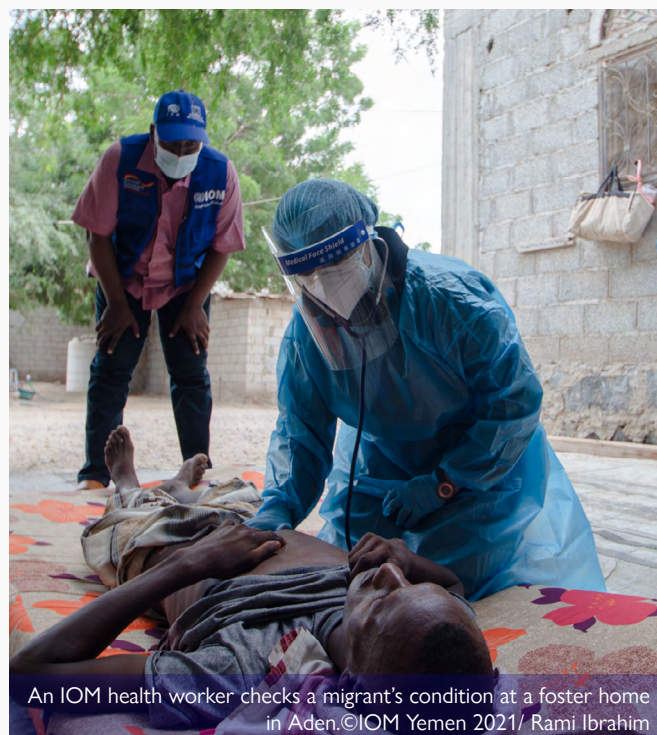
An IOM health worker checks a migrant's condition at a foster home in Aden.