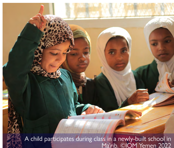
A child participates during class in a newly-built school in Ma'rib.

*Figure includes direct and indirect beneficiaries