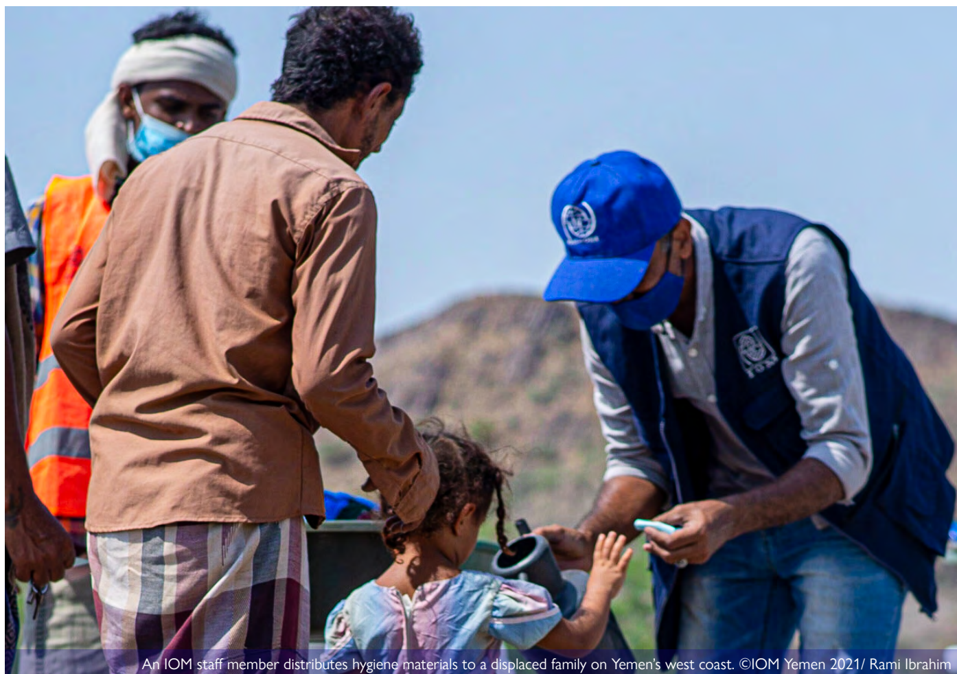
An IOM staff member distributes hygiene materials to a displaced family on Yemen's west coast.