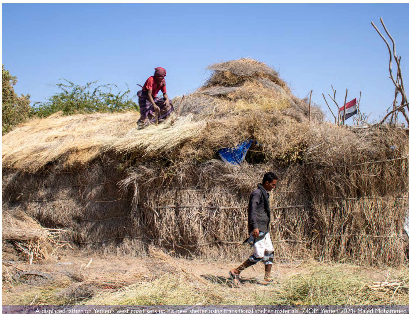
A displaced father on Yemen's west coast sets up his new shelter using transitional shelter materials.