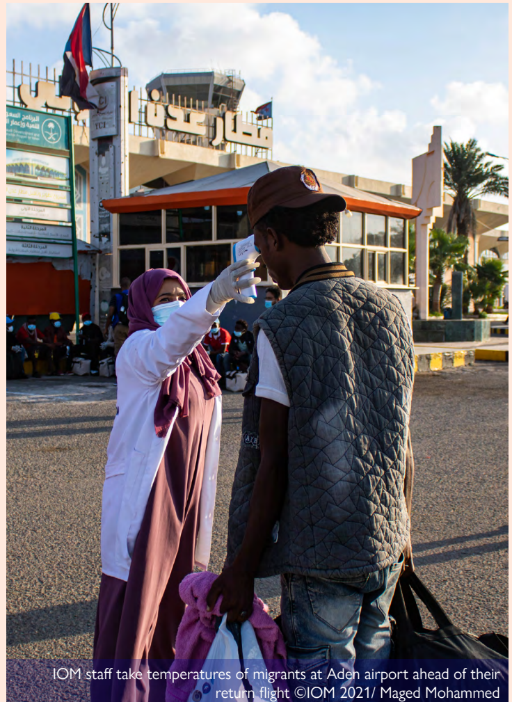
IOM staff take temperatures of migrants at Aden airport ahead of their return flight