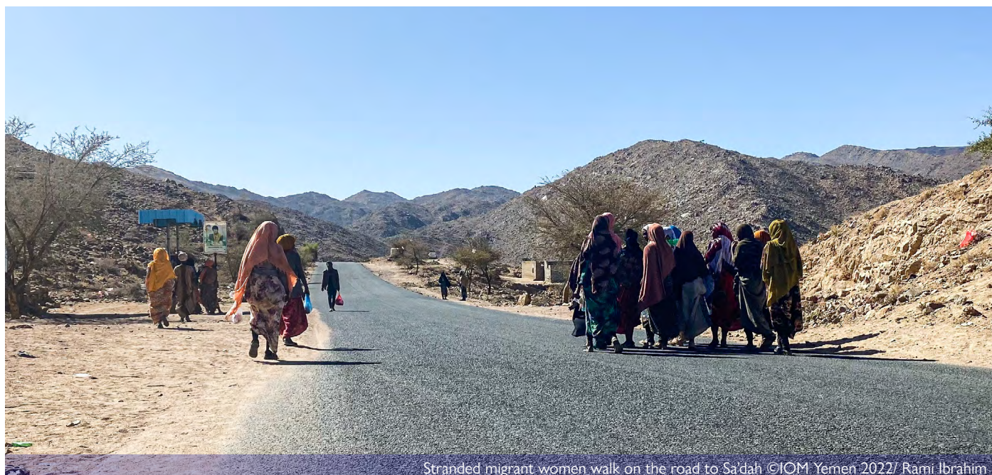
Stranded migrant women walk on the road to Sa'dah