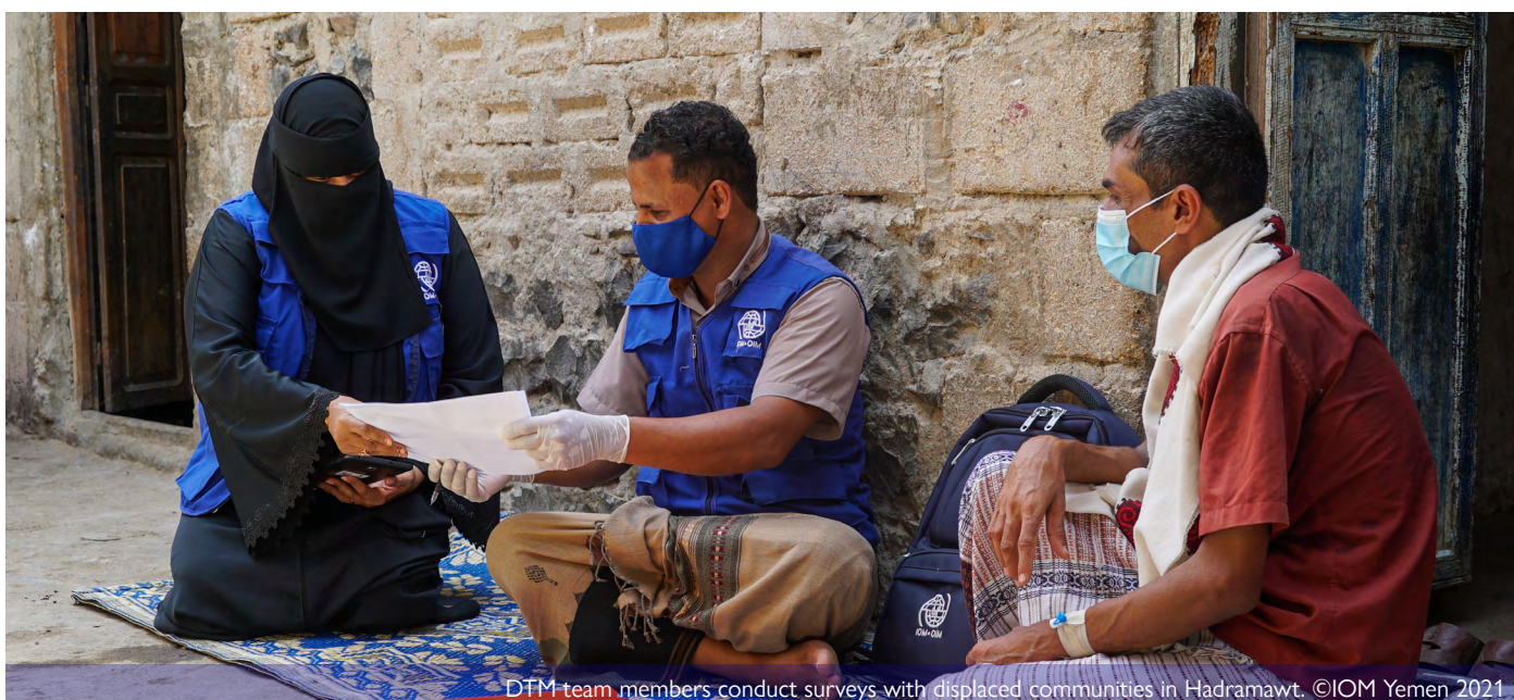
DTM team members conduct surveys with displaced communities in Hadramawt.