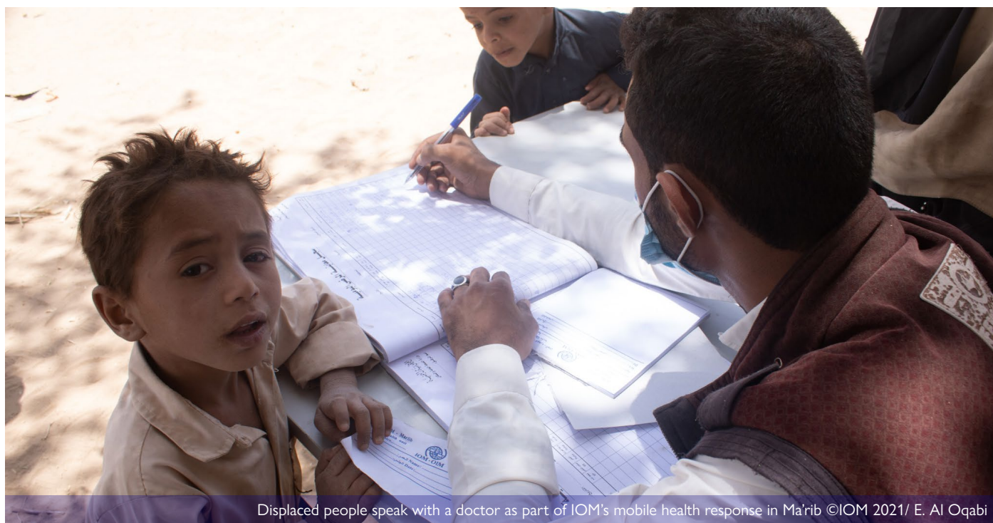
Displaced people speak with a doctor as part of IOM's mobile health response in Ma'rib

IOM has a team of 18 international and 125 national support and programme staff in Ma'rib as well as nearly 200 community mobilizers and enumerators. The team is leading response activities, prioritizing critical needs assessments and registering newly arrived IDPs for assistance through the Rapid Response Mechanism (RRM). Together with local authorities, the Organization is coordinating response efforts in Ma'rib through its leadership of the CCCM and Health sub-national clusters, co-leadership of the WASH sub-national cluster, Ma'rib-based focal point of the protection cluster, and as S-NFI Contingency Pipeline Manager.