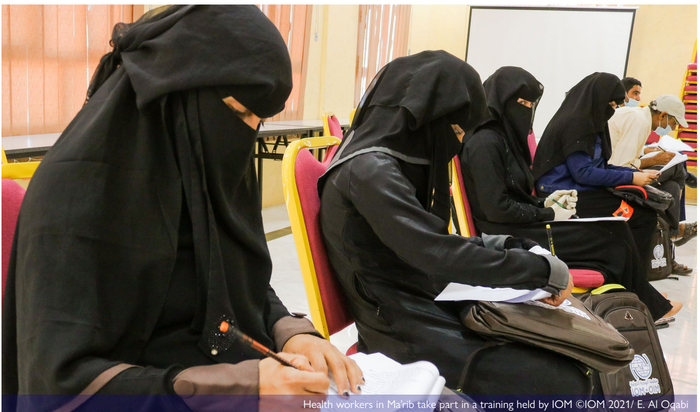
Health workers in Ma'rib take part in a training held by IOM