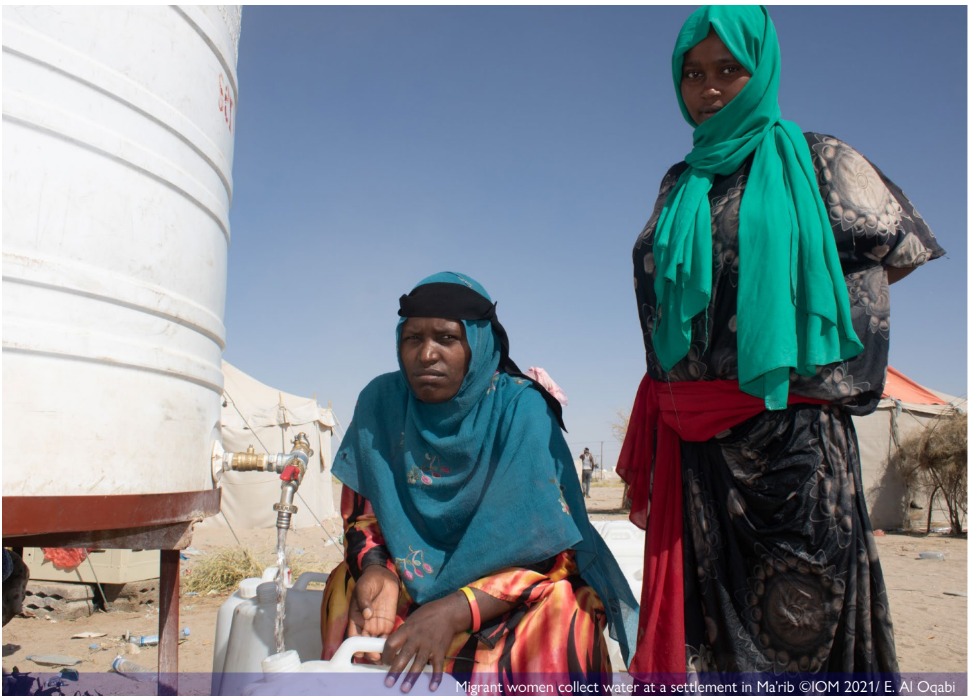
Migrant women collect water at a settlement in Ma'rib

In this context, protection concerns for migrants are mounting, and many continue to seek options to return home. IOM is providing WASH, protection, health and shelter services, and continuing small-scale food distributions, but the Organization cannot cover all needs. Humanitarian partners working in food security, in particular, are needed to assist migrants, stranded migrants do not have currently have access to the same food assistance as IDPs and migrants have limited alternatives/social networks for their food security.