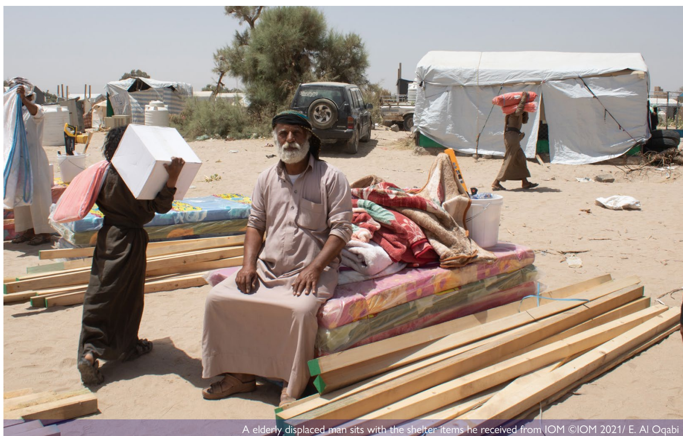
A elderly displaced man sits with the shelter items he received from IOM