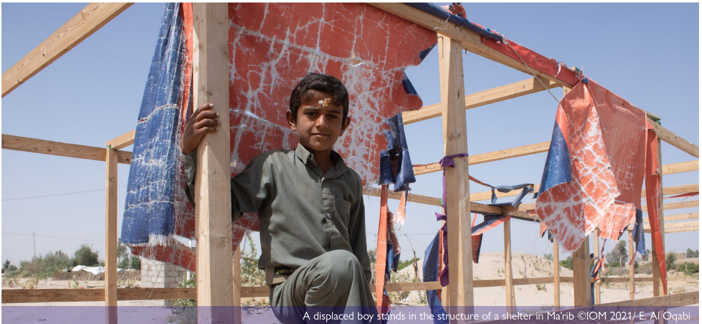
A displaced boy stands in the structure of a shelter in Ma'rib